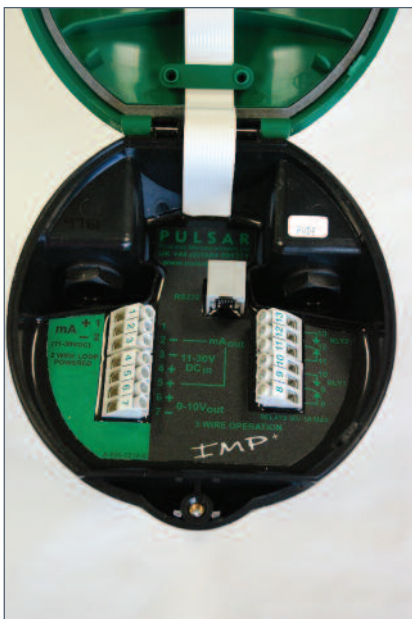
INSIDE OF STANDARD 2/3 WIRE IMP