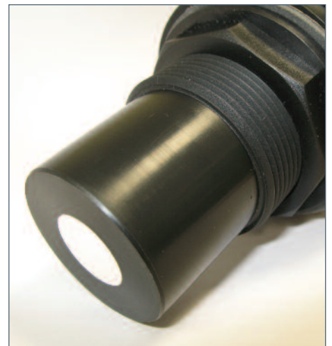
STANDARD IMP FACE