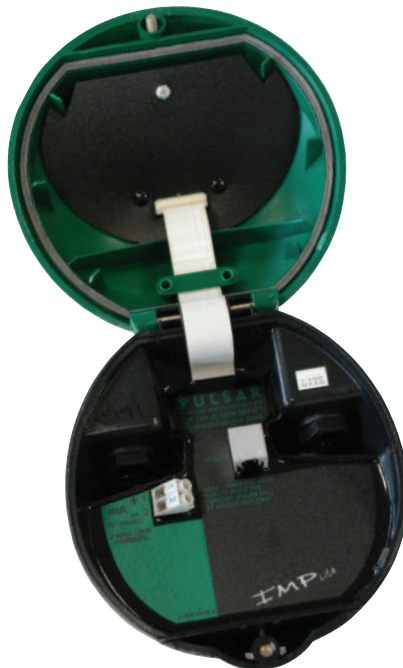
INSIDE OF IMP LITE SHOWING RJ11 PORT