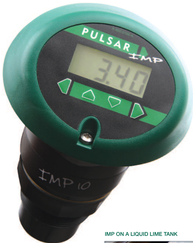
IMP ON A LIQUID LIME TANK