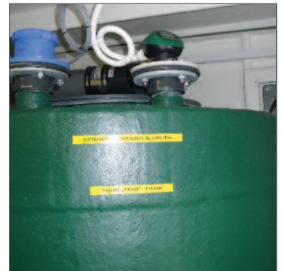
IMP ON CHEMICAL TANK