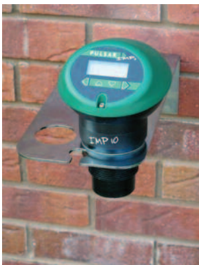
SPECIALY DESIGNED IMP BRACKET IS ALSO AVAILABLE