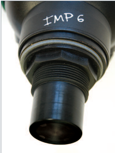
PVDF NOSE CONE OPTION

The full IMP range is available with the wetted parts in PVDF build alternative for corrosive or aggressive applications. The picture below shows a PVDF nose cone on an IMP 6 unit.