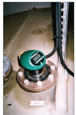
IMP ON A MIXING TANK