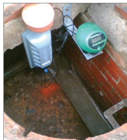
IMP MONITORING IN A CSO CHAMBER