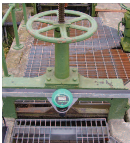
IMP CONTROLLING SCREEN HEIGHT