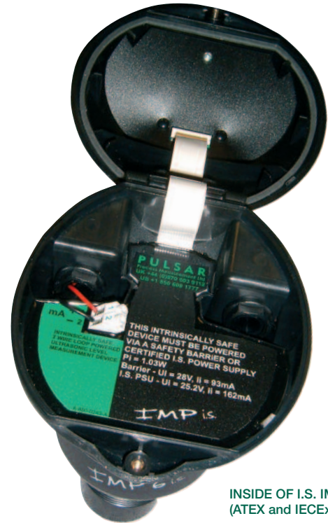
INSIDE OF I.S. IMP (ATEX and IECEx)

The full IMP range is available with the wetted parts in PVDF build alternative for corrosive or aggressive applications. The picture below shows a PVDF nose cone on an IMP 6 unit.