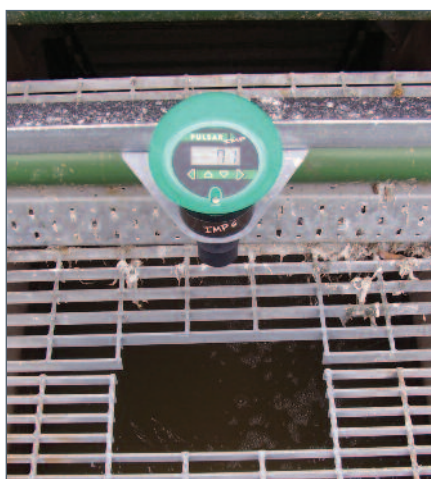
IMP CONTROLLING GATE HEIGHT