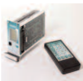
19" rack mount